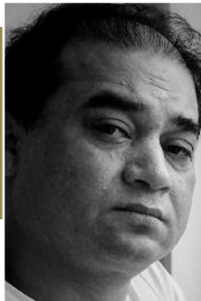
ILHAM TOHTI, CHINA

Sentenced to life imprisonment after an unfair trial for documenting interethnic violence