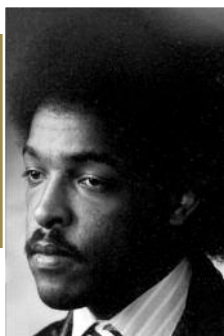
DAWIT ISAAK, ERITREA

Sentenced to life imprisonment for demanding democracy and human rights in Bahrain