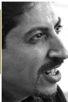
ABDULHADI AL-KHAWAJA, BAHRAIN

Sentenced to life imprisonment for defending the political and cultural rights of the Uyghur people